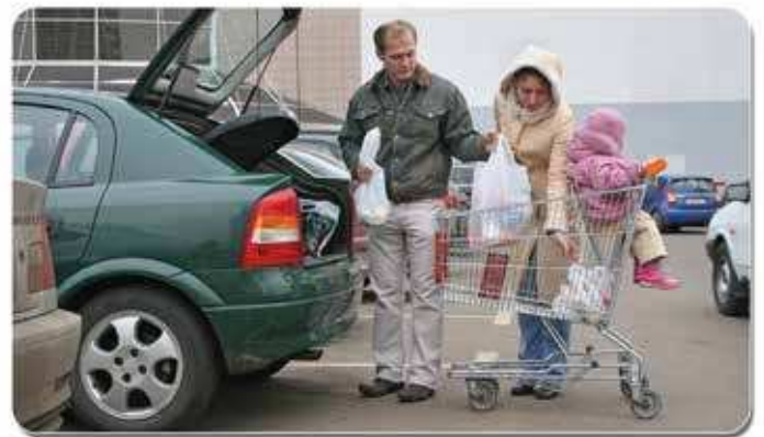
Formolene FORMAX® L9 Performance* vs. Other High Strength LLDPE Film Resins

■ Formolene FORMAX® L9 ■ octene LLDPE ■ metallocene LLDPE